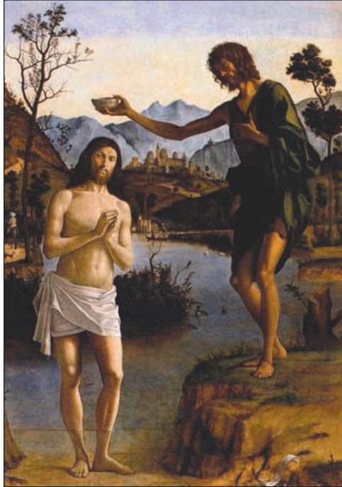
Baptism of Christ by Cima.

Love of God and neighbor, then, is the basic principle on which the moral law is based. Catholic moral teaching provides the answer to this critical question: How can we best reflect our love for God and other people in our thoughts, words, and deeds?