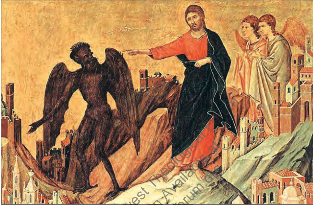
Temptation on the Mount by Duccio. Jesus' morality is not a morality of rules, but rather a morality that includes laws and precepts. Moral laws help us differentiate between good and evil.

Natural law is the participation of man in the plan of God. It is the objective order established by God that determines the requirements for people to thrive and reach fulfillment, enabling man "to discern by reason the good and the evil, the truth and the lie." 3