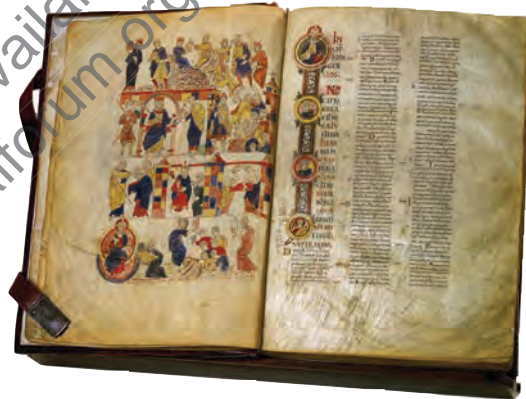
The Bible of Ripoll opened to Genesis. We need to study our “playbooks,” the Bible and the teachings of the Church, to learn what Jesus expects of us.

The life of a Christian is a lot like that—at least it ought to be. To live in this world the way Christ taught us takes preparation. We need to study our “playbooks”—the Bible and the teachings of the Church—to learn what Jesus expects of us. If we want to become stronger with the indispensable help of God's grace, we must “work out” our faith regularly through prayer, the Sacraments, growth in virtue, and service to others. To avoid being penalized, we need to learn the rules Christ asks us to live by, and we must discipline ourselves accordingly with self-control. God's laws are the means required by human nature to fulfill our innate desire for happiness. We must use our time well and keep our eyes focused always on the ultimate prize—eternal life and happiness in Heaven.