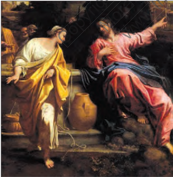
The Samaritan Woman at the Well by Carracci. Love of God and neighbor—Jesus himself fulfills the precepts of the Law: “You shall love your neighbor as yourself.”

Moral law is not just about human sexuality. Mention the word “morality,” particularly in the context of Catholic moral teaching, and many people are likely to think first of issues pertaining to