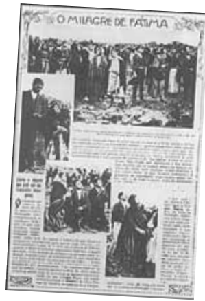
A 1917 newspaper account of the Miracle of the Sun

Lucia stated that during Mary's final vis-